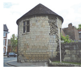
St Mary's Tower (in the Abbey's defensive walls)

You can do a self-guided walk by using the Friends of York Walls website "Walls Trail" pages [FREE], or the book "A Walking Guide to York's City Walls" [£6.99], or the new "York's City Walls Audio Trail" [£1.99 via the Guide.AI app, guide ID 80]. Further information on all these is available at — www.yorkwalls.org.uk