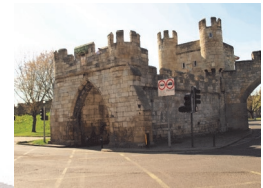
Walmgate Bar (the only bar which still has a barbican extending from its gateway to defend it)