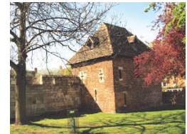
Red Tower (at the south edge of the land once flooded to make the King's Fishpool)