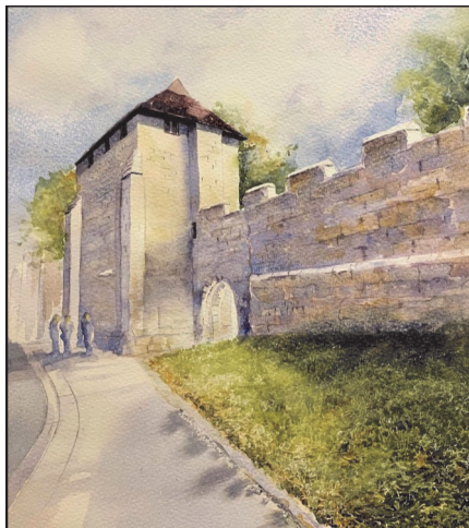
"Fishergate Postern Tower"

Friends of York Walls lease the tower from the City of York Council. Displays here are about the tower and the history of the City Walls. Entry is free on our open days, and we can also open for payment. Planned Open Day dates are listed in the next column. For £20, you can "Sponsor a Stone" in your name or for someone else – you choose a stone on an external wall of the tower, then a certificate and book entries link that stone uniquely to the name you give [the next column explains how to sponsor your own stone]. Currently we need money for better displays, electrics and for roof repairs. Please help FOYW to carry on returning the tower to fuller community use.