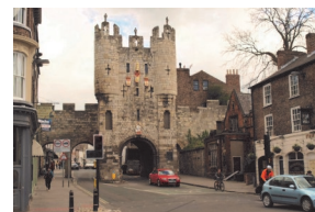
Micklegate Bar (with walls museum)