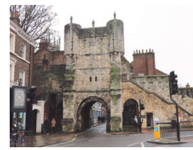
Bootham Bar (with portcullis and walk-through room)