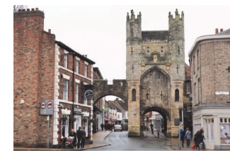
Monk Bar (with portcullis)