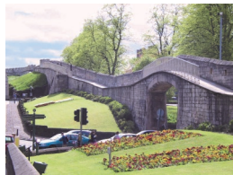
East of the station the City Walls were pierced for roads and railways during the 19th century