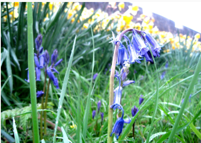
Bluebells invaded by a slope of daffs