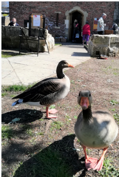
Unexpected visitors - Photo: Ian Tempest

On Monday 12 April the Red Tower set out tables and chairs for the first time this year following the opportunity for eating outdoors provided in the new government guidelines. Customers using the food services were able to sit out on the lawn outside the Tower for the first time since the autumn. The Red Tower is open every Monday at the moment for its food distribution to the local community, and thanks are due to the supermarkets for their support.