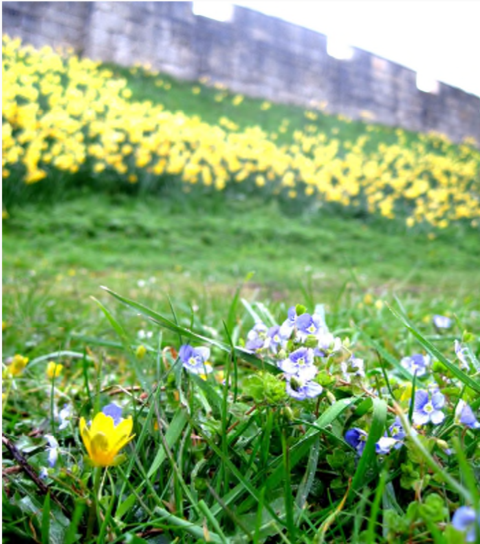
Celandine amongst speedwell on the flat

These photos are of the ramparts opposite the Barbican Centre. You can walk beside these slopes, on the flat but off the pavement and enjoy the flowers of spring earlier here than in most places around York. The slopes face south, in places there is shelter from trees - and perhaps the busy road brings warmth too. Celandines have probably been in flower here for a month, they are one of the early spring flowers which FoYW chair, Bill, is hoping to plant more of. The speedwell is a little later and will last longer in flower, though its individual flowers are said to be specially fragile, making its old Yorkshire names 'remember me' and 'forget-me-not' seem a little sad.