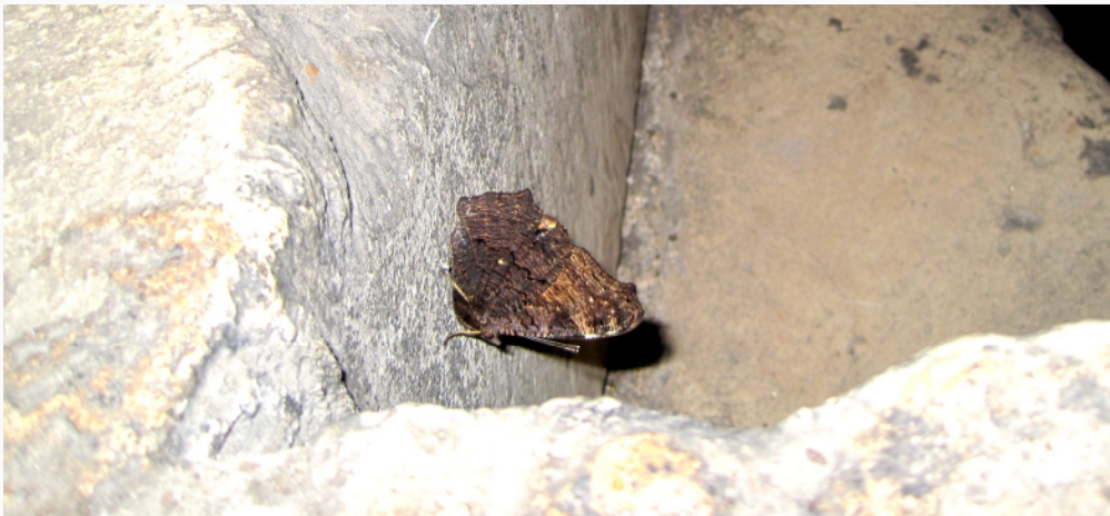
April 10th: half-way up the stairs at Fishergate Postern Tower

I found this hibernating[?] butterfly and at least 3 others in Fishergate Postern Tower when I was checking the sealed windows there to see what possibilities there are for increasing ventilation in time for this year's first projected opening in late May.