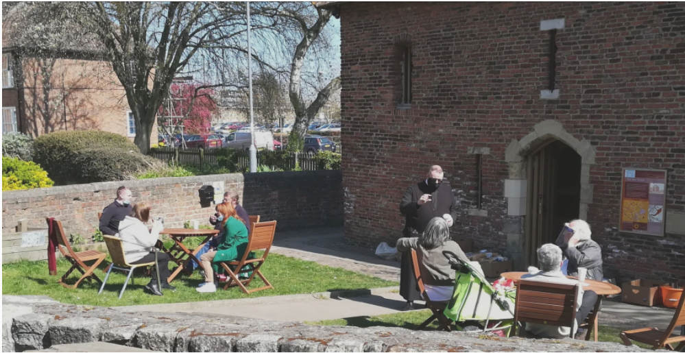
Red Tower open again - Photo: Ian Tempest

On Monday 12 April the Red Tower set out tables and chairs for the first time this year following the opportunity for eating outdoors provided in the new government guidelines. Customers using the food services were able to sit out on the lawn outside the Tower for the first time since the autumn. The Red Tower is open every Monday at the moment for its food distribution to the local community, and thanks are due to the supermarkets for their support.