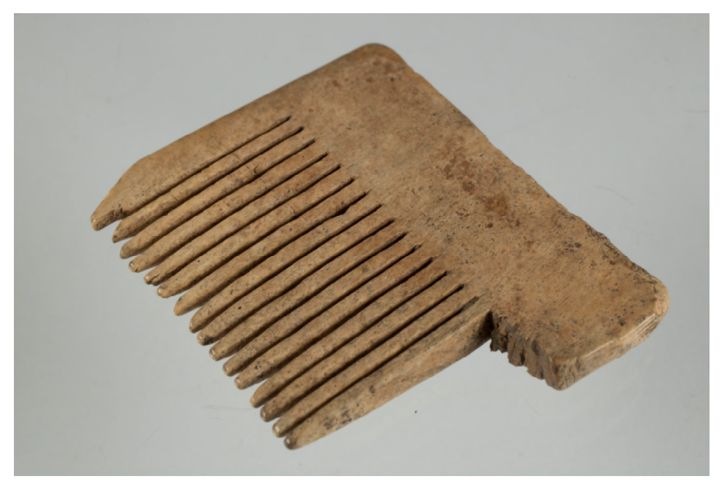
Post -medieval comb found at the Fishergate Postern Tower

*Photogrammetry is the science of making measurements from photographs. The output is typically a map, a drawing, a measurement, or a 3D model of some real-world object or scene (www.photogrammetry.com)