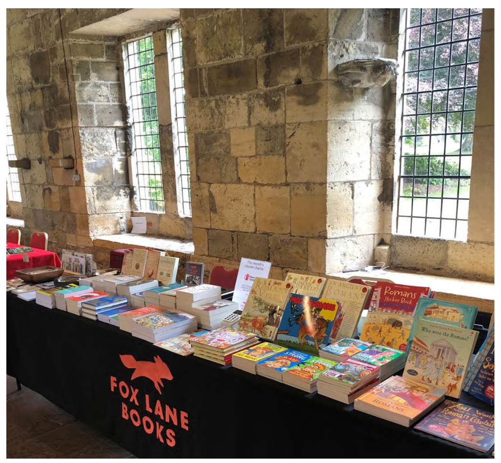
Fox Lane Books at the Roman Festival

The stall photo, below, is from the Hospitium where I bumped into her at the Roman Festival. She was also at the Festival of Ideas.