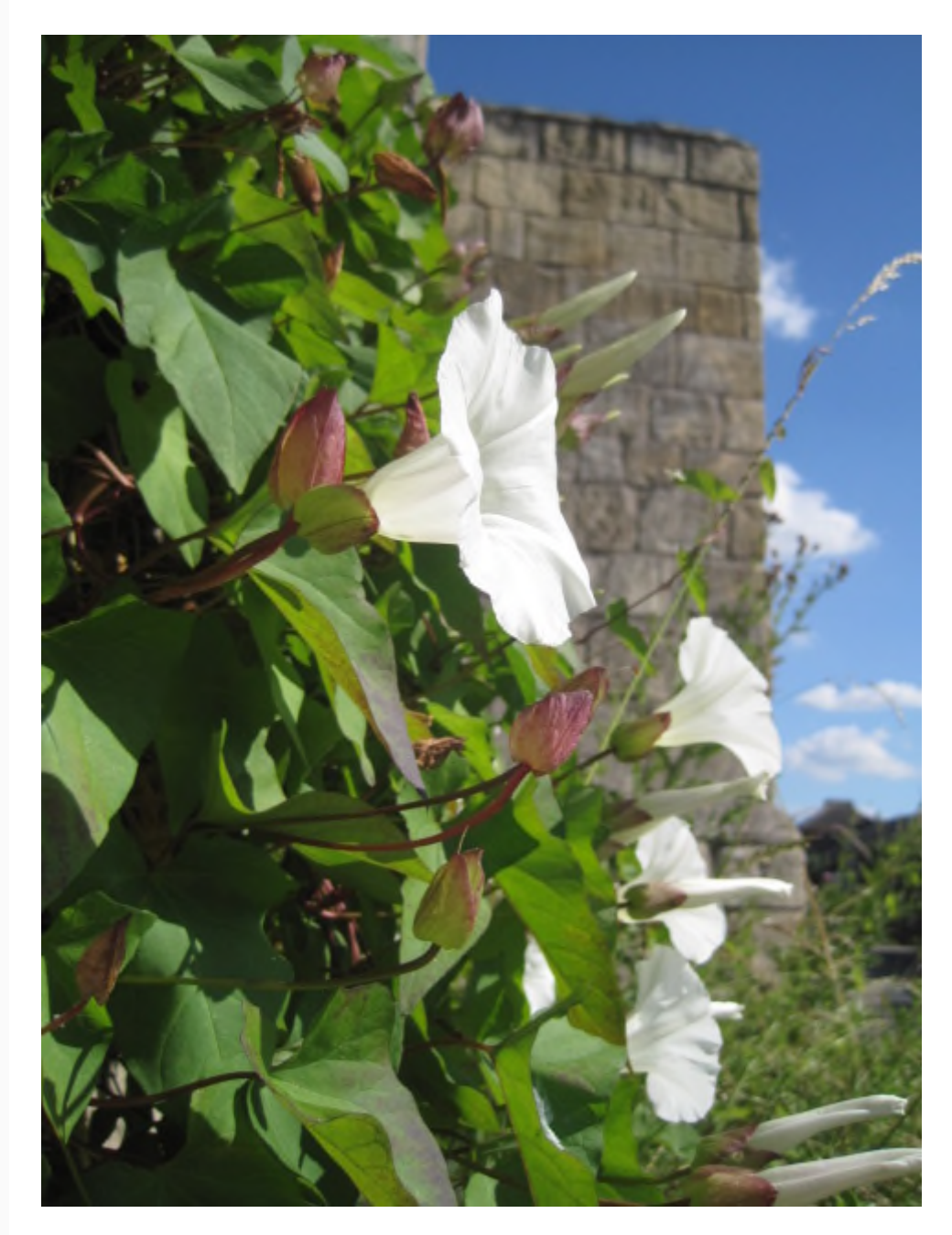
The 'larger bindweed' on the Walls near Fishergate corner tower

July's flower is the bindweed, AKA 'Devil's guts', 'bearbind' [=barley-tie] 'or 'granny hop out of bed'.