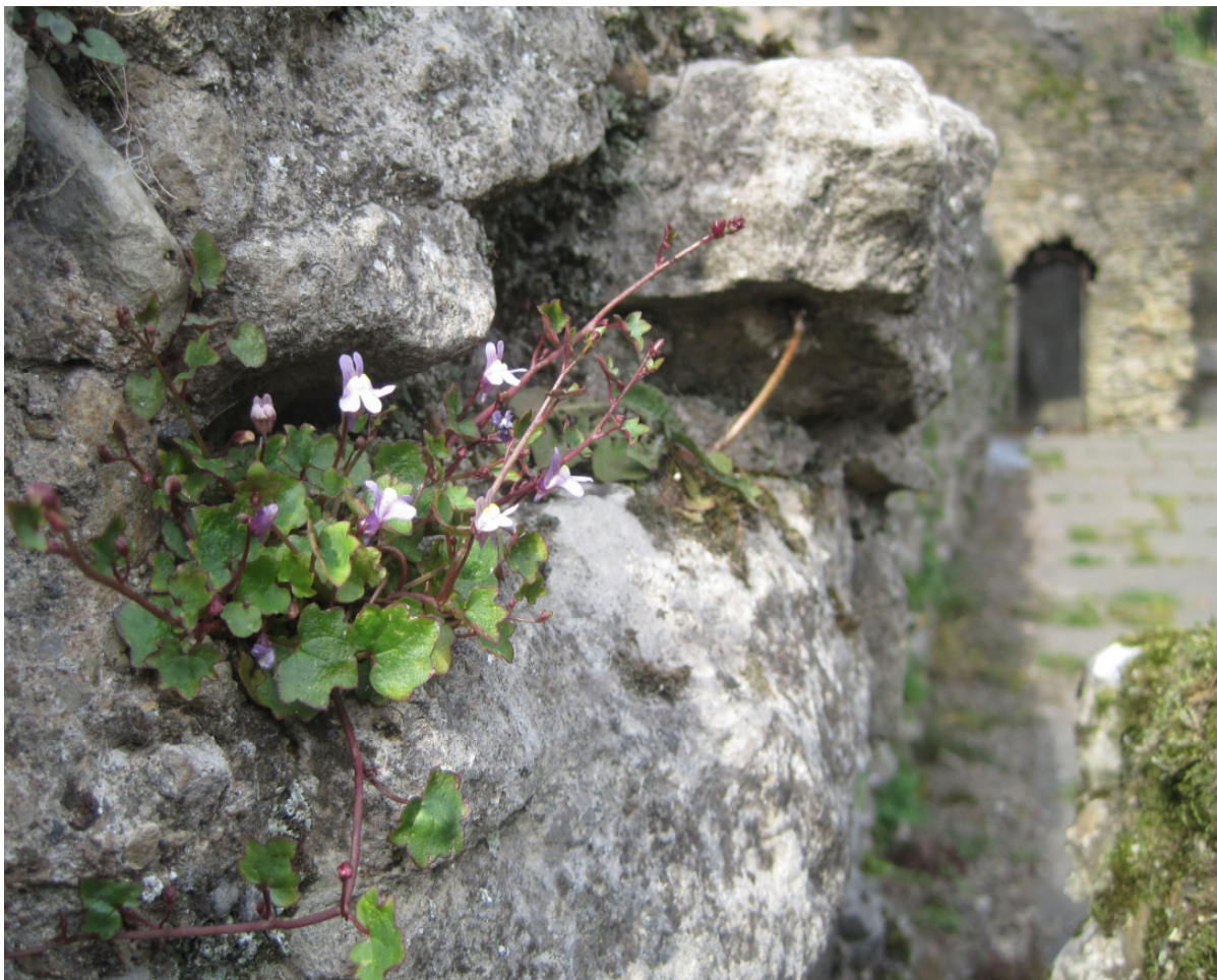
Ivy leaved toadflax in Roman walls by the Anglian Tower

Ivy leaved toadflax is almost totally a flower of the Walls themselves rather than the earth ramparts. At the moment its 'thousands' [of plants and flowers] are to be found behind the library and beside the wall-walk, especially in the Minster section.