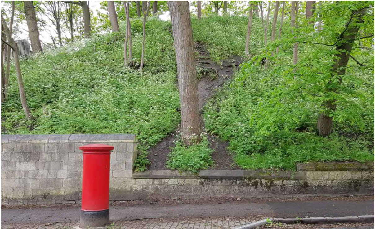
Baile Hill Today

Source: 'The Streets of York - Four Centuries of Change', 2018