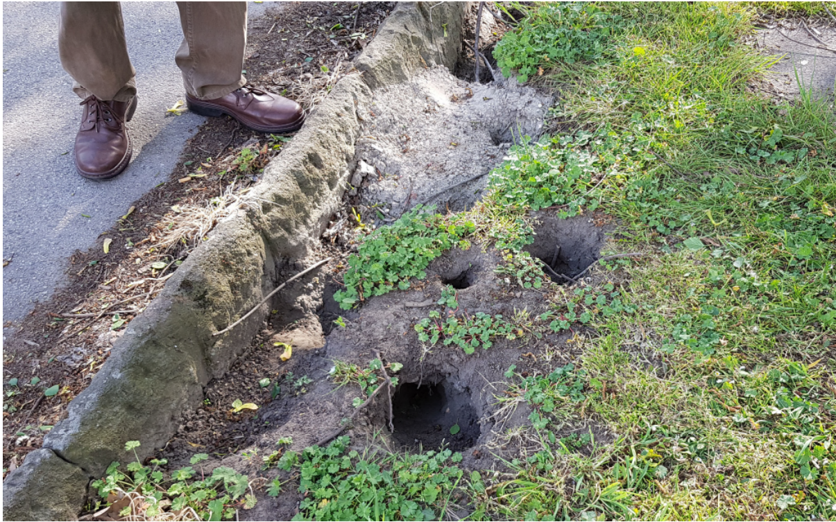
Mysterious holes in the ramparts

Our best guess is that they are ratholes, and give access to a sewer below. Has anybody any other theories?