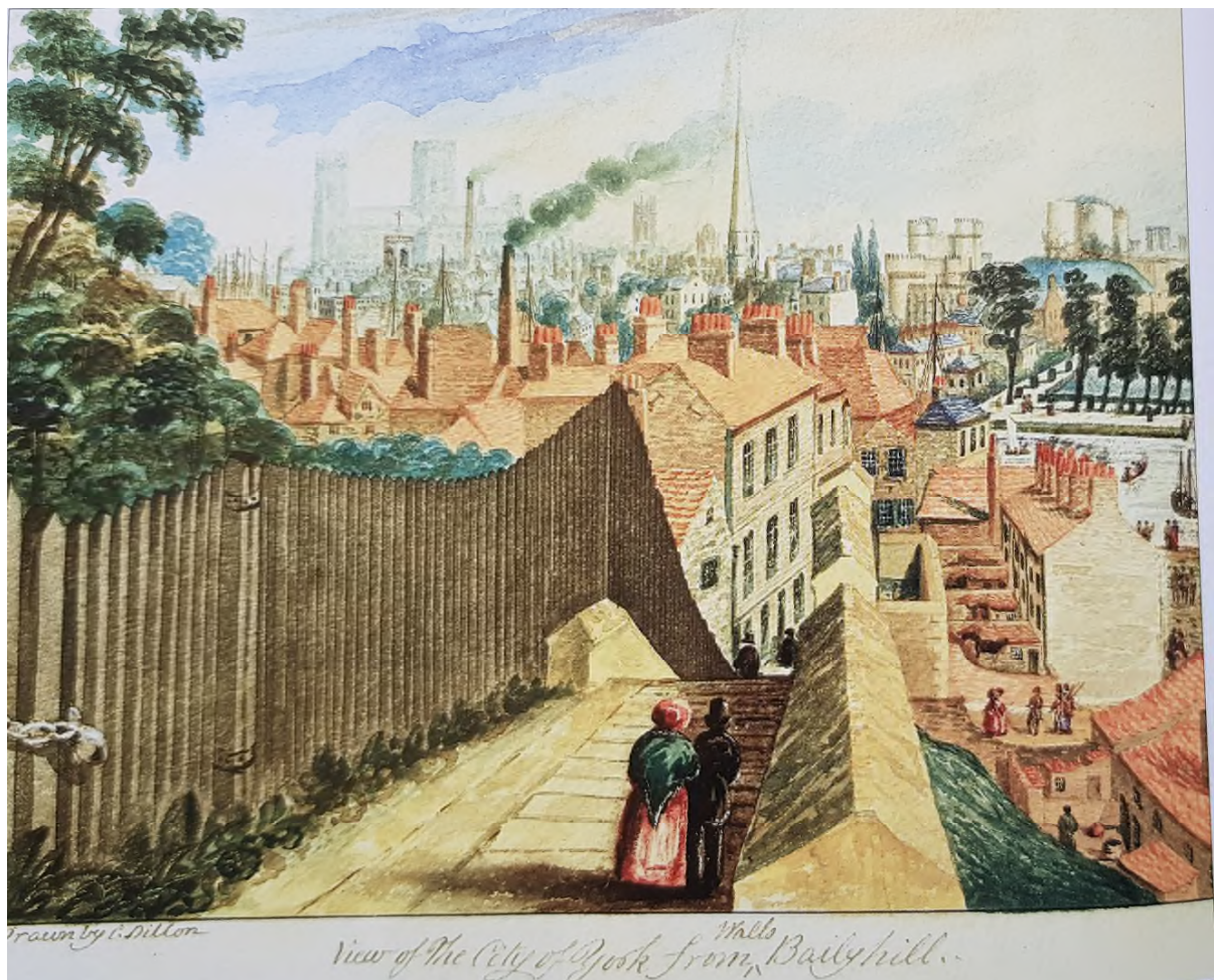
'Bailehill' from 'The Streets of York - Four Centuries of Change'