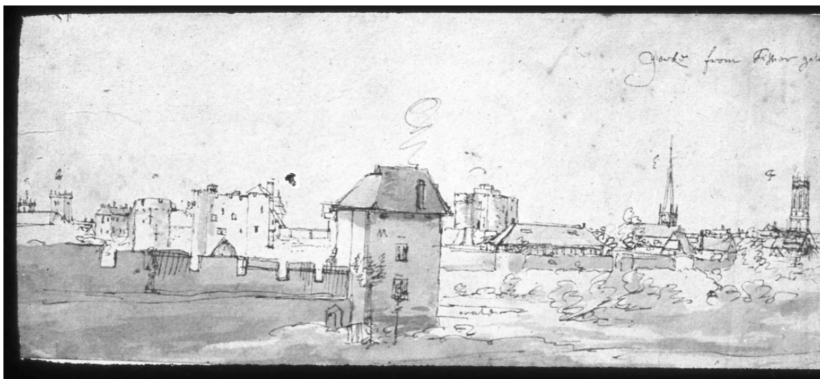
Part of a sketch of the FPT by Francis Place in 1675 - from the Evelyn Collection (Ser No 0829)

The sketch above is the left hand half of a panorama of York, which is just visible on the AFM presentation image above it. It shows the tower, and the postern gate but there are no signs of the portcullis mechanism or access stairs. Was this artistic license?