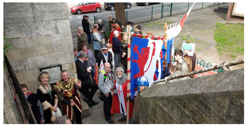
The Sheriff's Party at the FPT