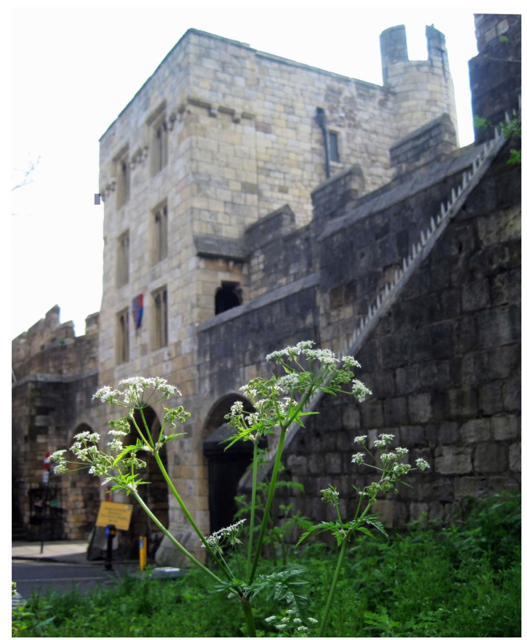
Cow Parsley by Micklegate Bar