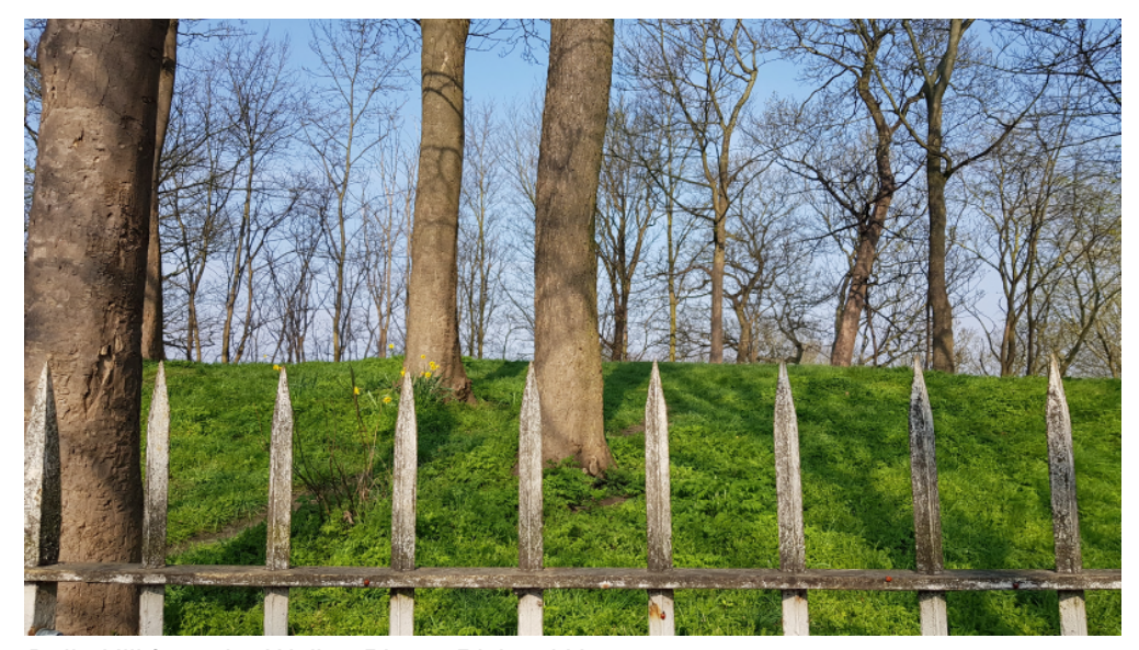
Baile Hill from the Walls