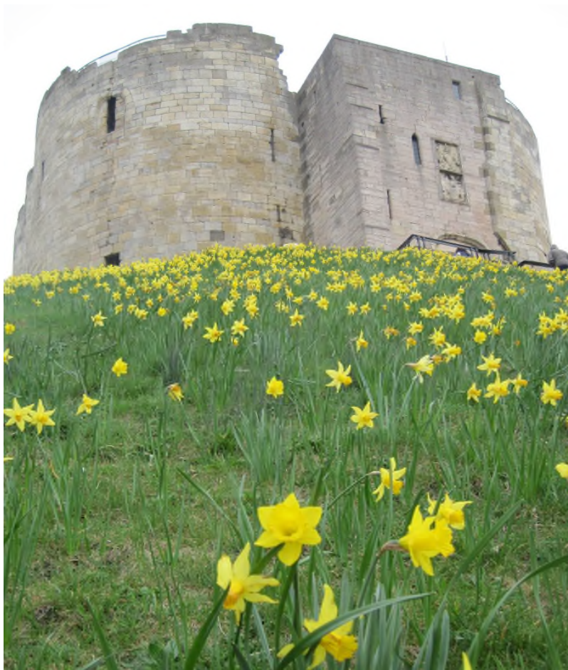
Daffodils on the Ramparts