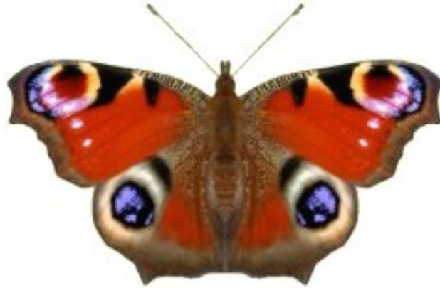
Peacock Butterfly

Bill: They are Peacocks and aren't dead. When I was prowling around during the dig in December there must have been 20 of them.