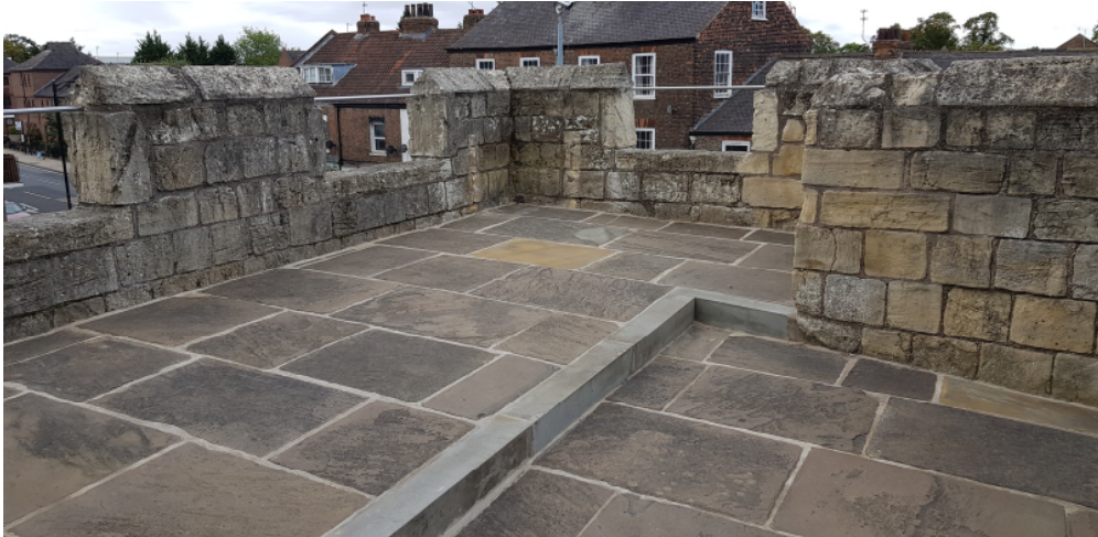
The Repaired Tower 39 Roof

The repairs to Tower 39, just near the Fishergate Postern Tower, are complete. They have done a very good job with the re-instated paving.