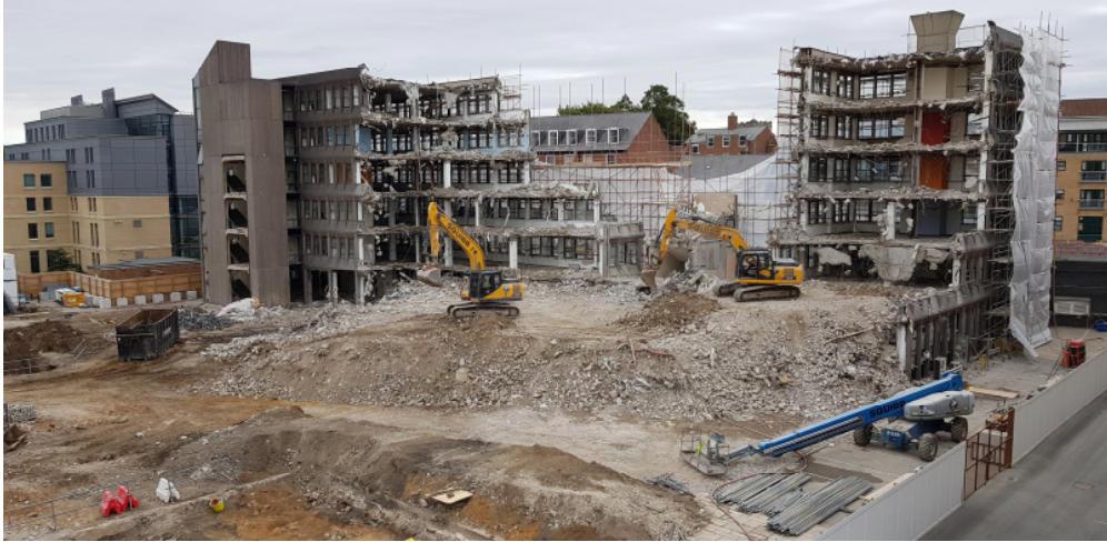
Hudson House is Almost Gone