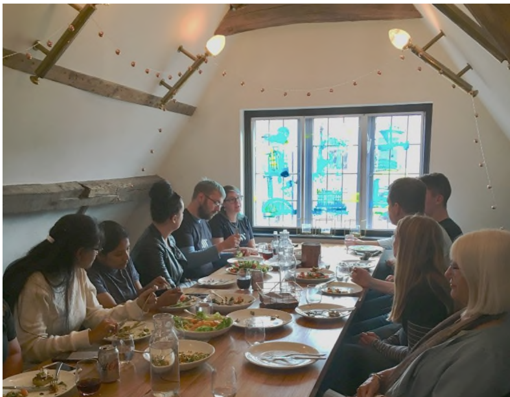
Litter-picker Lunch at the Rattle Owl