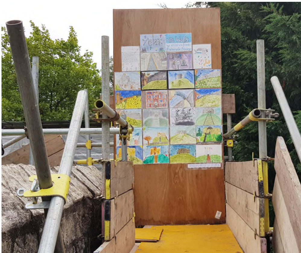
Pictures by Fishergate Primary School Near New Tower - Photo: Richard Hanage

'The rapid completion of works at Tower 39 meant that the wonderful pictures by children of Fishergate Primary School were only on display there for a short time. However, we are delighted to report that Simon arranged for most of them to be moved to a smaller but also prominent board near 'New Tower' (near Layerthorpe Bridge), where extensive repairs are taking place.'