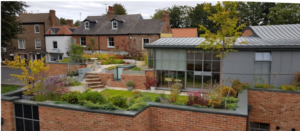
Roof Garden near Monk Bar

While litter-picking (see above) we saw the beautiful roof-garden belonging to the new house near Monk Bar, and also the final stages of the demolition of ugly 1960's Hudson House. I welcome the former, and do not mourn the passing of the latter, which will be replaced by flats and modern offices.