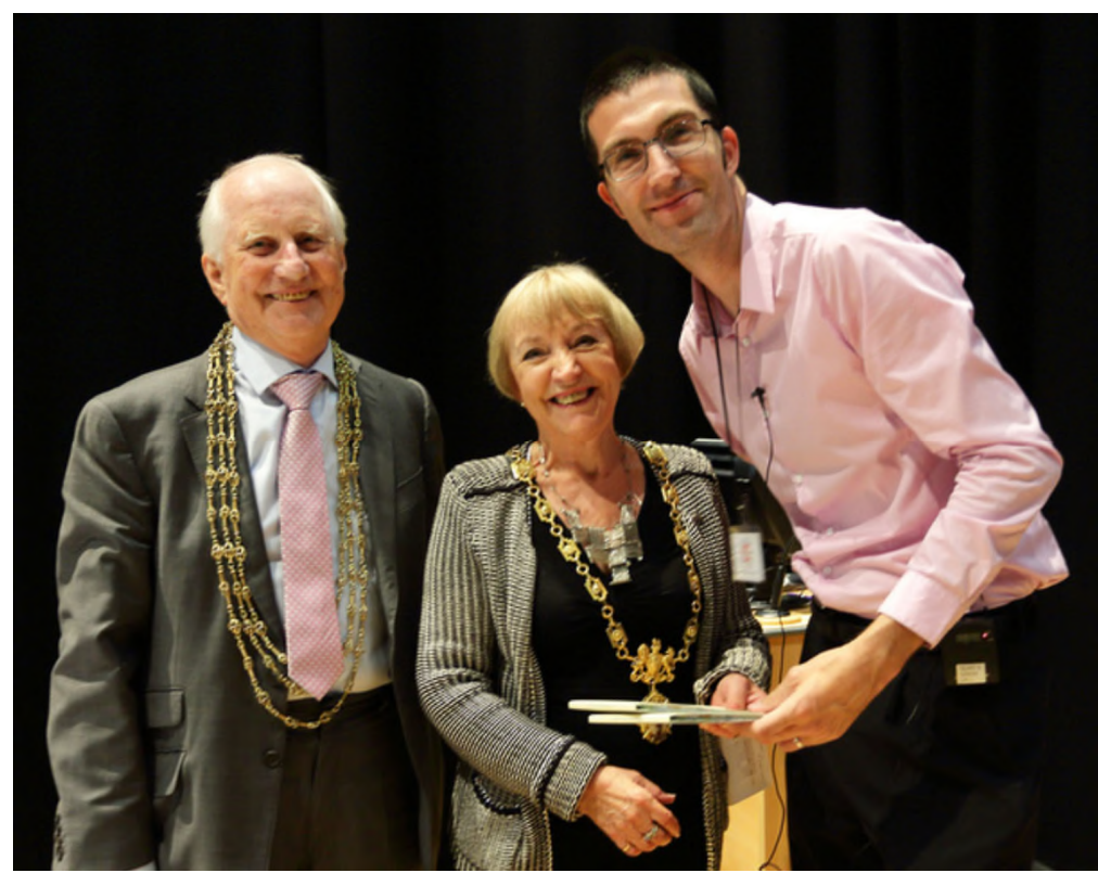
Presenting the Mayor and Sheriff with the New 1850 Map