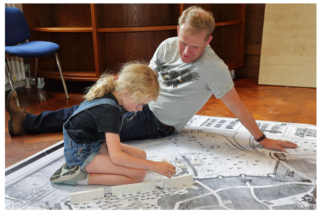
Map Attack at York Explore

Explore York Libraries and Archives was delighted to be able to participate in the inaugural York Walls Festival. Our 'Map Attack' event, where participants are challenged to recreate historic York – and its walls – out of Lego and Duplo, was a great success. Using copies of maps from the city's archives as inspiration, 54 adults and children spent Saturday afternoon working on a number of amazing creations, and our feedback was universally positive. This is an event we have run at Explore a number of times before, and it was great that it fitted the bill for the festival as well.