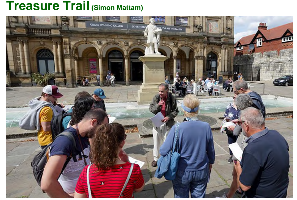
Simon's Treasure Trail

was demolished to make way for Leetham's barges in 1865.