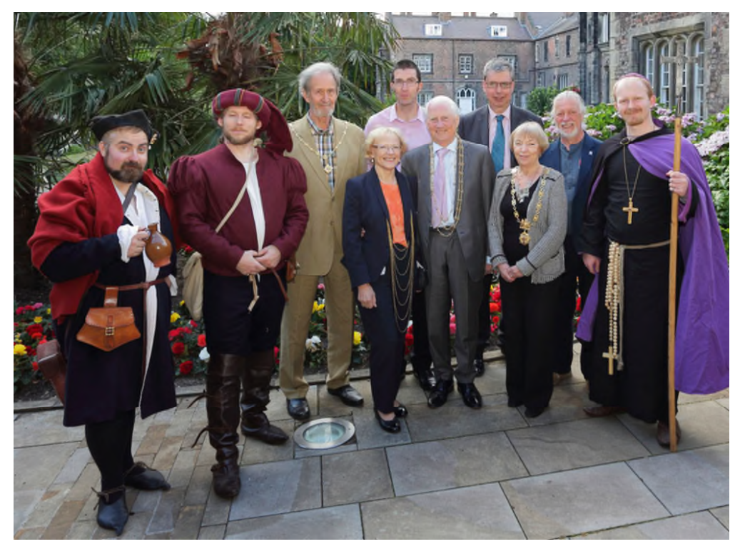
The Festival Launch Dignataries