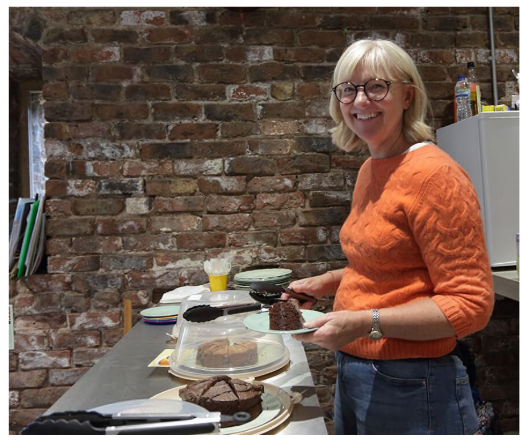
Very Popular Cakes at Red Tower at Red Tower

The Red Tower enjoyed one of its busiest days ever for the Festival, welcoming over 300 visitors and benefiting from generous donations for refreshments. The tower's detailed Civil War passport stamp was popular - we set up a stamping station in the garden with Wall leaflets and maps, and a steady stream of explorers came to get their next stamp. The sunshine meant that the garden cafe tables were full most of the day and much tea and cake was consumed!