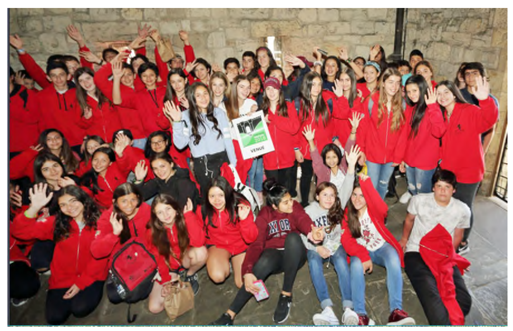
Chilean Students at Bootham Bar - Photo: Lewis Outing

We had a stall in Bootham Bar, providing information and stamping Walls Explorer Trail passports. Bootham Bar was the starting point for Simon Mattam's treasure trail.