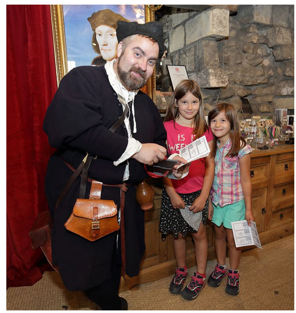
Medieval Costumed Staff at Micklegate Bar