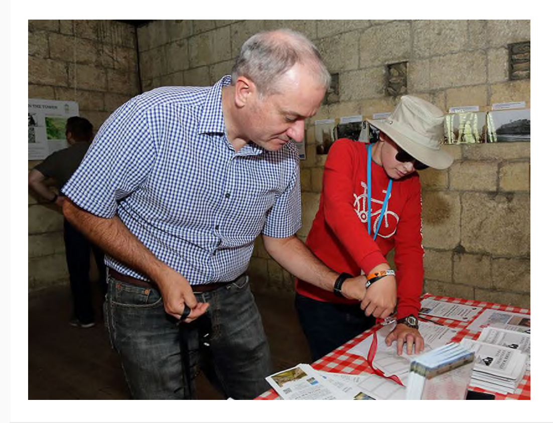
Outdoor Display at Fishergate Postern Tower