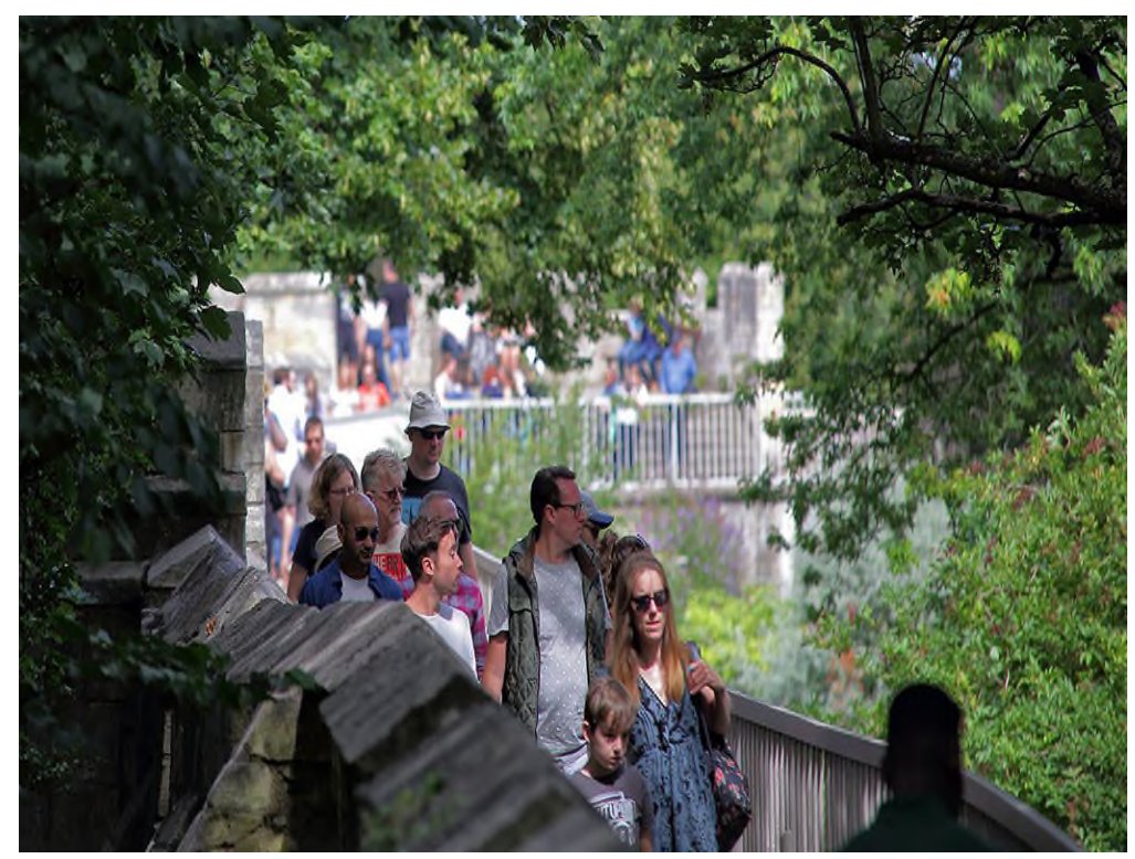
Busy Walls Near Bootham Bar