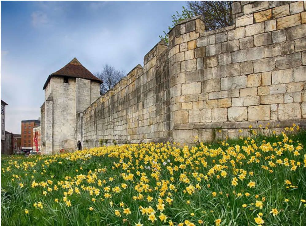
Daffodils near the FPT

Unfortunately they are now past their best, but he has tweeted a great picture of bluebells at Clifford's Tower....though it's a pity that they are the Spanish variety!