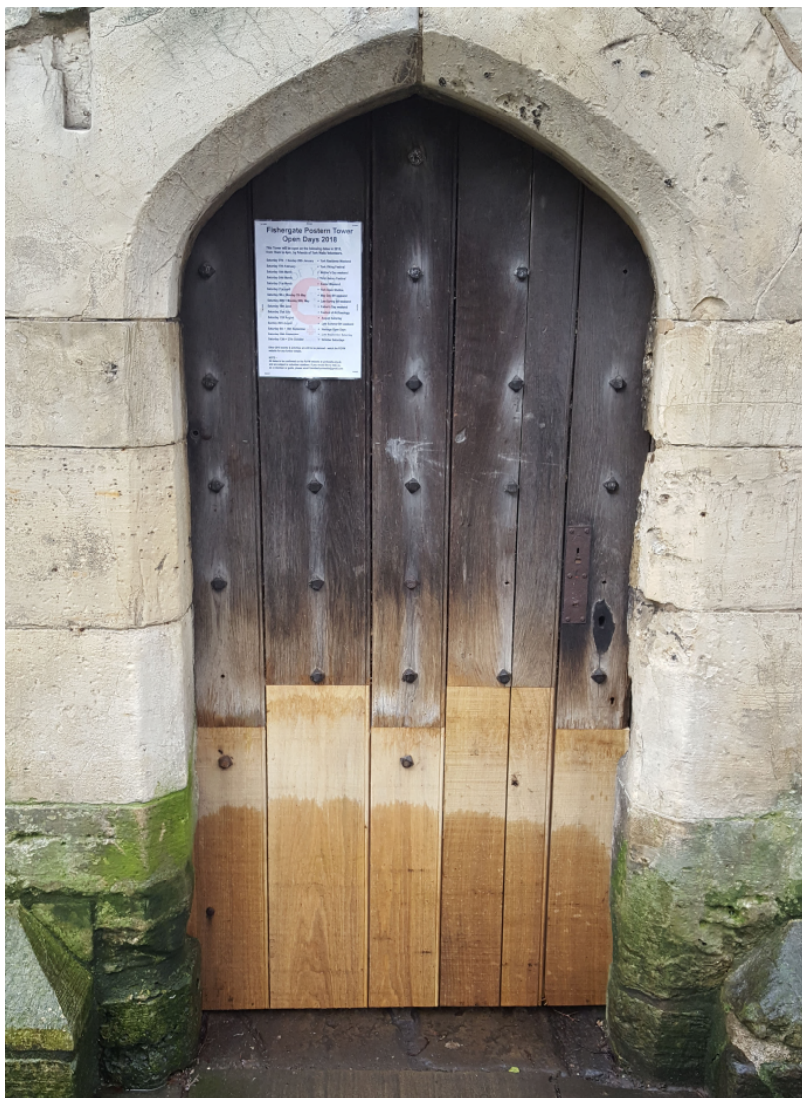
The New Door (on a wet day)

Note that it was raining on the day I took this picture, and it is clear that the bottom part of the door gets very wet – which is presumably why it rotted so badly. I understand that we plan to apply some preservative when the wood has darkened a little. There are several studs missing, and we are planning to replace these shortly, with help from the Civic Trust.