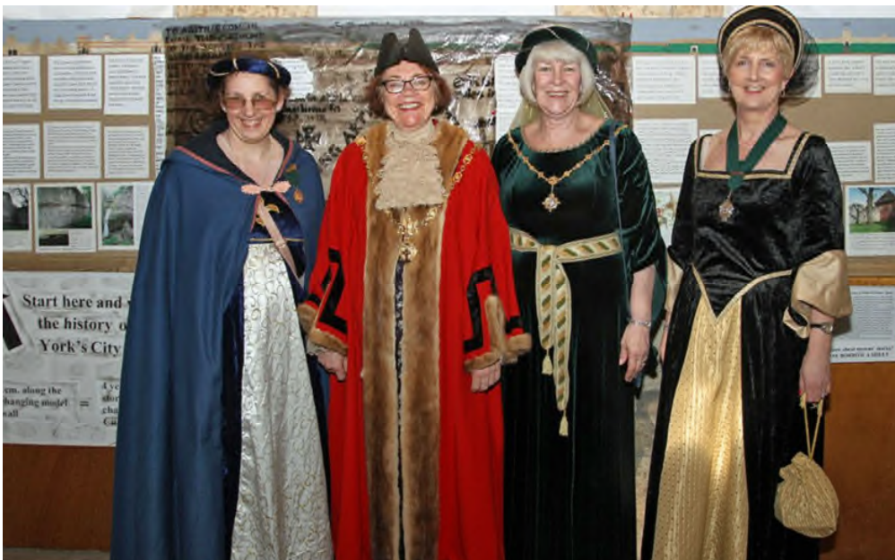
The Sheriff's party in the FPT - Photo: Lewis Outing