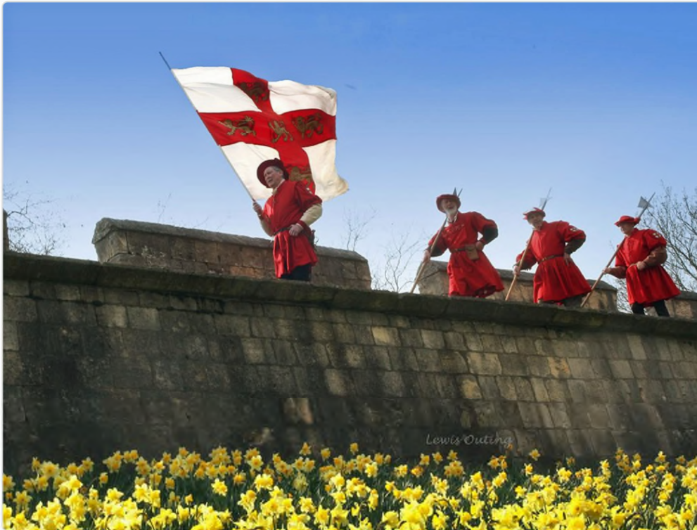
The Sheriff's guards