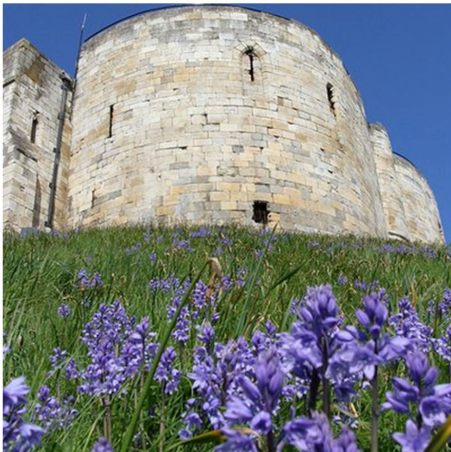
Bluebells at Clifford's Tower

Bluebells Clifford's Tower York @EnglishHeritage @VisitYork @Britanniacomms #spring #bluebells #York #cliffordstower