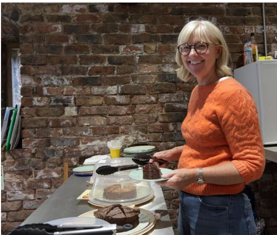
Very Popular Cakes at Red Tower at Red Tower