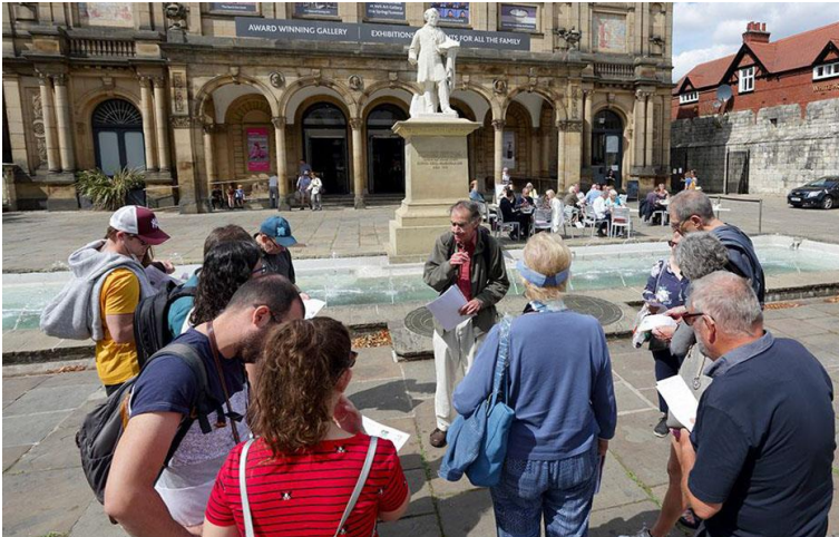
Simon's Treasure Trail

Ever since York Museums Trust changed its mind about using my Treasure Trail I've hoped to rescue it from redundancy. It was conceived as a do-it-yourself trail but there seemed no good reason why it could not be used to add interest and more active participation to a led walk during the festival.