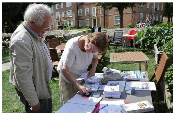
Passport Stamping at Red Tower