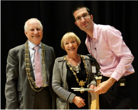
Presenting the Mayor and Sheriff with the newly published 1850 map of York.