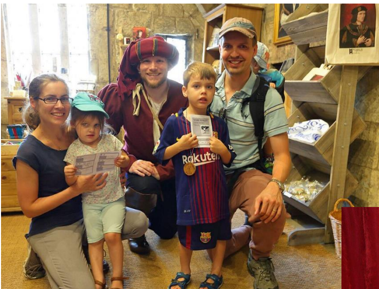
Following the Trail at Monk Bar - Photo: Lewis Outing

At Monk Bar we had a Bishop who was able to relay an account of the Battle of Myton when a levy of York men, led by the Archbishop and the Lord Mayor of York, faced battle hardened