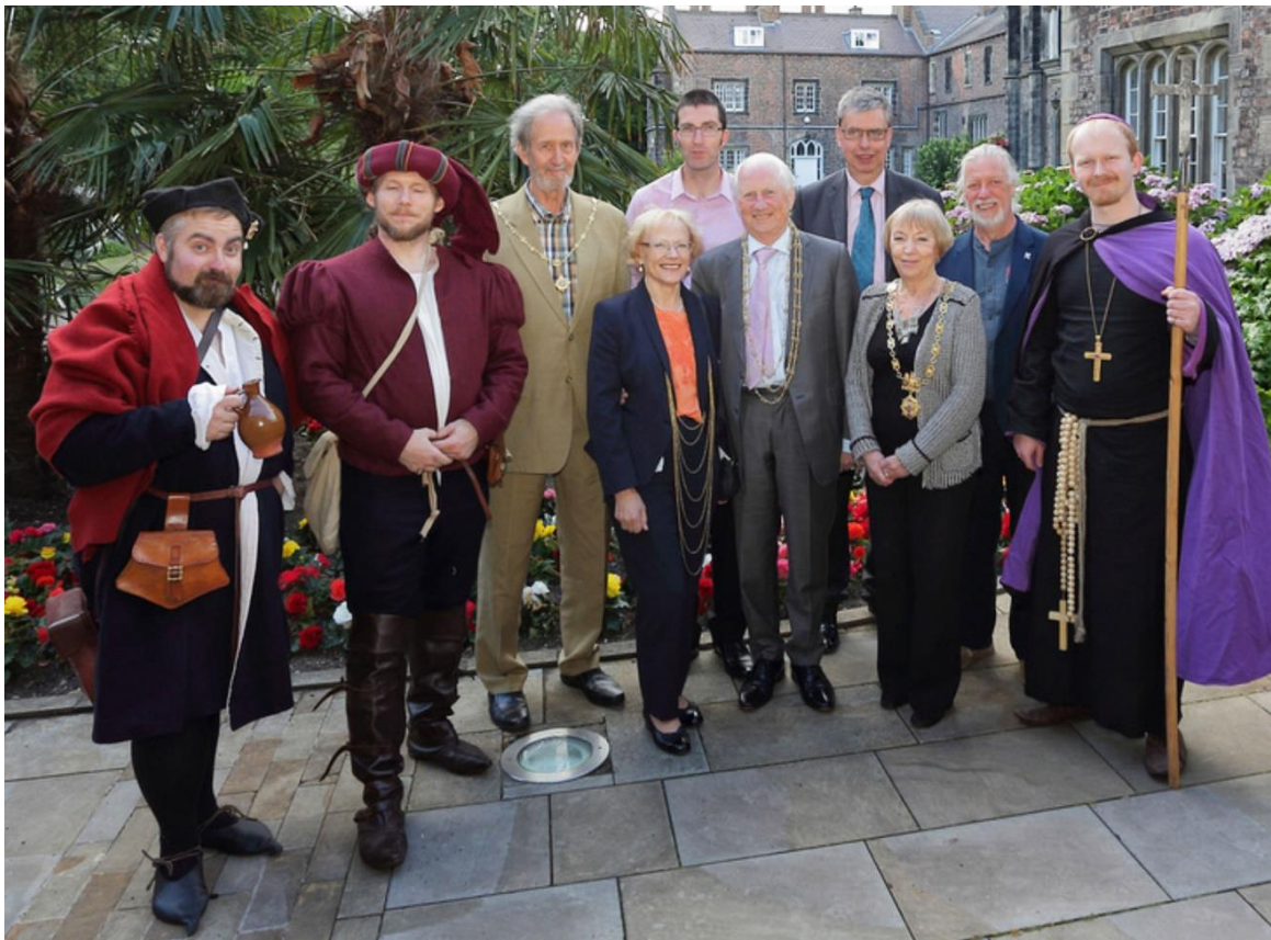
The Festival Launch Dignataries