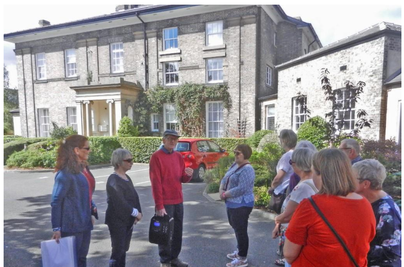
The Fishergate Walk

Then to Fishergate Bar, with its scorched masonry blocks, still visible from the fire of 1489. Leaving the walls, we walked past the former cattle market to the site of All Saint's Church, where archaeologists found the skeletons of civil war soldiers and an