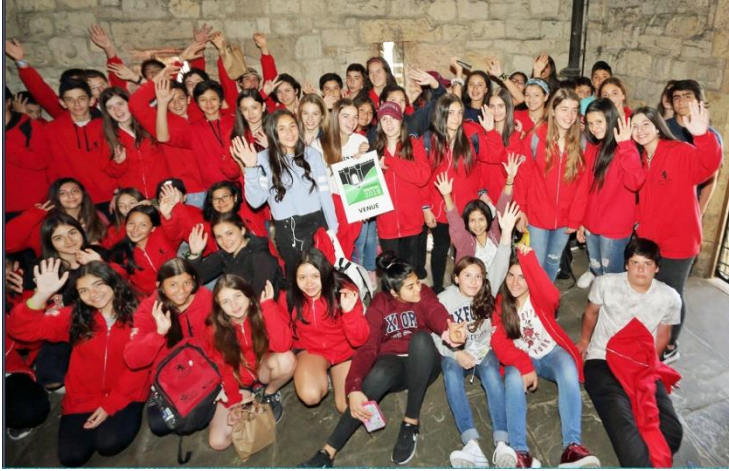
Chilean Students at Bootham Bar

We had a stall in Bootham Bar, providing information and stamping Walls Explorer Trail passports. Bootham Bar was the starting point for Simon Mattam's treasure trail.