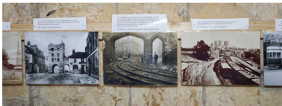
Archive Images at Fishergate Postern Tower