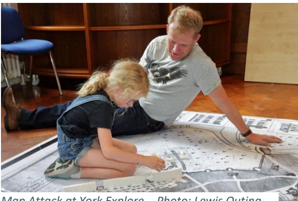
Map Attack at York Explore

Explore York Libraries and Archives was delighted to be able to participate in the inaugural York Walls Festival. Our 'Map Attack' event, where participants are challenged to recreate historic York – and its walls – out of Lego and Duplo, was a great success. Using copies of maps from the city's archives as inspiration, 54 adults and children spent Saturday afternoon working on a number of amazing creations, and our feedback was universally positive. This is an event we have