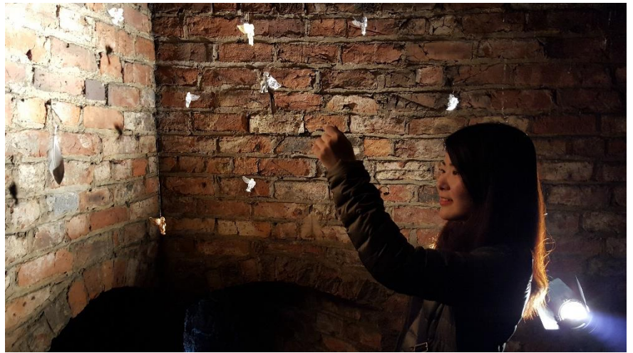
Flying angels at Red Tower

The Red Tower team have just completed an installation, comprising nine site-specific works installed in the Red Tower. It is a collaboration between York St. John University and Schoolhouse Gallery. The commissioned artists are all studying for a Masters in Fine Art at York St John University. Find out more about the Red Tower project at