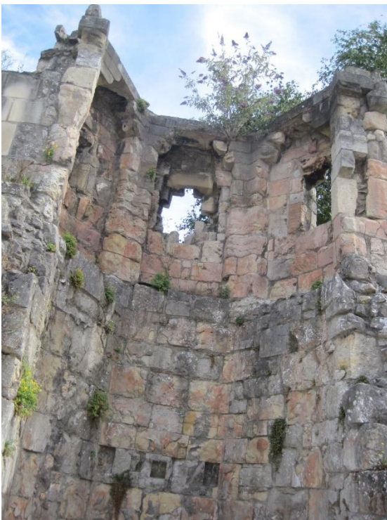
Incendiary bomb damage?

Readers' contributions of other unknowns, or of information about the following, will be very welcome. A selection of replies will be in the next e-News.