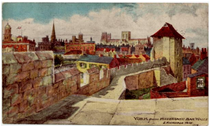
Fishergate Postern Tower