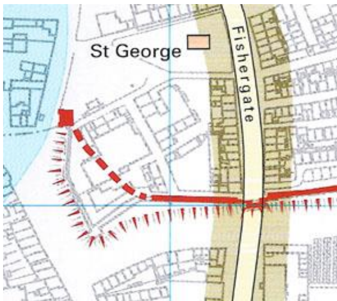
The Alignment of the Walls at Fishergate Corner c.1300 From the York Historical Atlas.

In the recently published and wonderful York Historical Atlas, there is a puzzling map of the walls