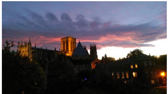
The Minster from the Walls

The publicity for the event seemed to work very well - with coverage not only on our own FOYW website, Facebook and Twitter (many likes and re-tweets) but also via the official IY2016 channels, Radio York, the BBC, etc.