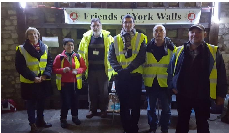
Some of the Volunteers for Illuminating York