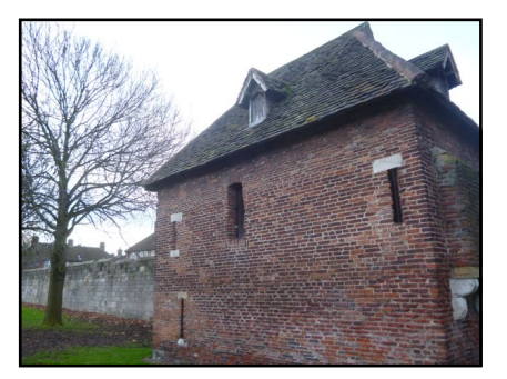
Red Tower - Opened twice in 2014, the first ever occasions when the public could see inside.

Our website remains: <u>www.yorkwalls.org.uk</u> and there are links to our Flickr group, Twitter and Facebook accounts on there.