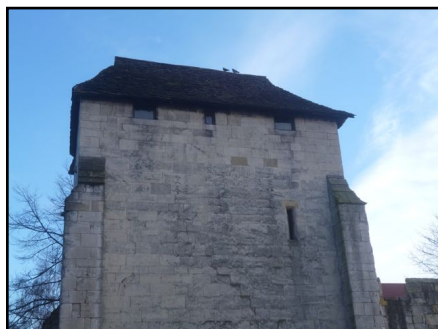
Fishergate Postern Tower (You can now sponsor stones on the north wall - see website)

We opened Fishergate Postern Tower (FPT) to the public on 36 days during 2014, including for the York Curiouser arts festival. We had over 3,800 visitors on the 19 ordinary open days, and almost 1,000 during the York Curiouser arts festival.