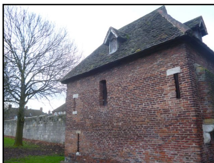
Red Tower - Opened twice in 2014, the first ever occasions when the public could see inside.

Our website remains: www.yorkwalls.org.uk and there are links to our Flickr group, Twitter and Facebook accounts on there.